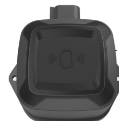
RANGE EXTENDER Active antenna