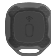
PASSIVE KEY DUPLICATOR Small and portable