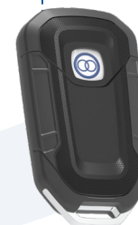
INTELLIGENT KEYFOB Low consumption