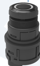
ACTIVE ECU Mainly customizable